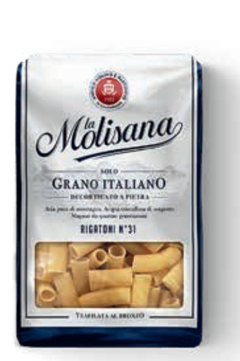
La Molisana Rigatoni N°31 in current packaging.

Within 8 years, La Molisana has changed its brand image and design 5 times. Currently, the company relies on muted front colours and no colours at the package's side. Although the muted design is not easy in terms of packaging technology (neither when looking at the machine nor the packaging material supplier), the company chose this haptically appealing variant.