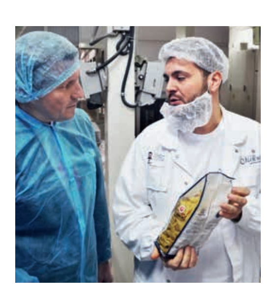
A close and trusting collaboration.