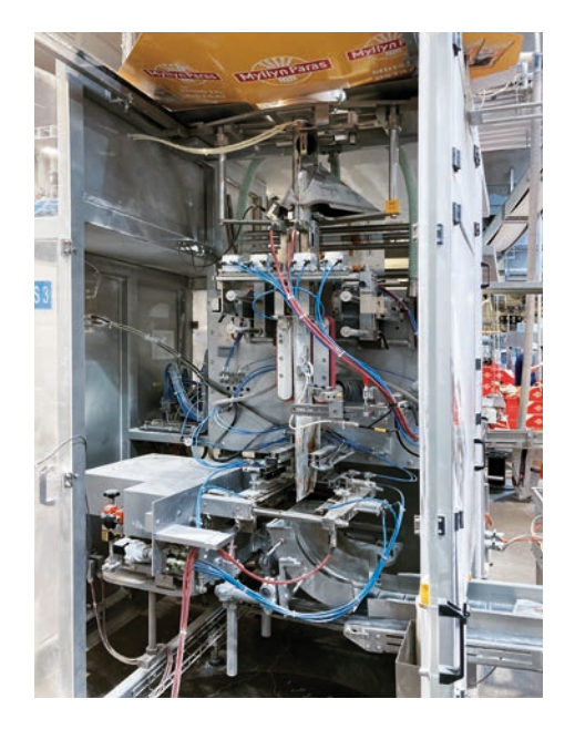
And after 6 years in 2-shift operation (5 days/week).

Oat flakes and breadcrumbs are packed in alternation.